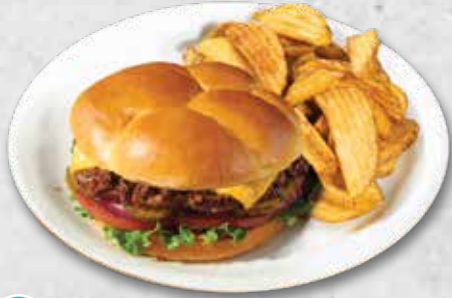
new! DENNY'S CHEESEBURGER Certified Angus Beef® burger, American cheese, lettuce, tomato, red onion, pickles, and All-American sauce, on a brioche bun. AED 56