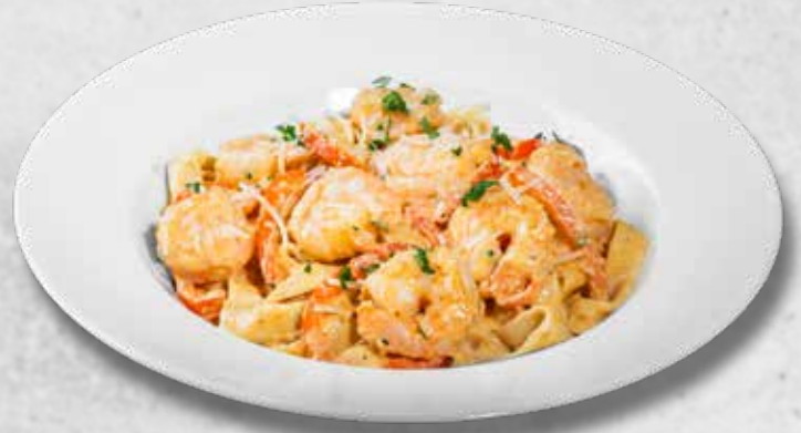
new! CAJUN SHRIMP PASTA Cajun flavor creamy pasta with shrimp and bell peppers, topped with fresh parsley and Parmesan. AED 66