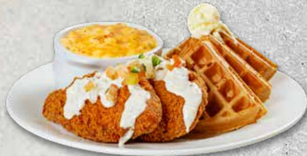
CHICKEN & WAFFLES Belgian waffle drizzled with caramel sauce, paired with golden fried boneless chicken, topped with Pepper Jack Queso and Pico de Gallo, served with a side of Mac 'N Cheese. AED 73