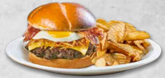
SLAMBURGER® Certified Angus Beef® burger, with hash browns, egg*, beef bacon, and American cheese on a brioche bun. AED 59