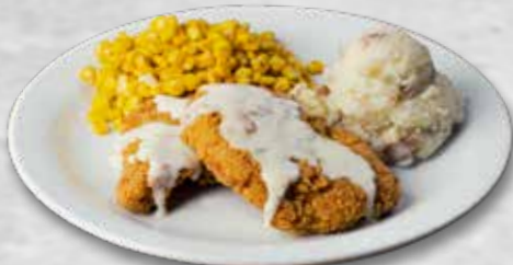
PLATE LICKIN' FRIED CHICKEN

Golden-fried boneless chicken fillets smothered in country gravy, served with a choice of two sides. AED 69