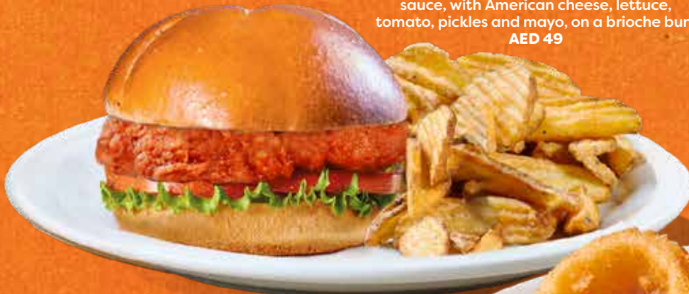
new! HOT BUFFALO CHICKEN BURGER Golden-fried chicken, tossed in buffalo sauce, with American cheese, lettuce, tomato, pickles and mayo, on a brioche bun. AED 49