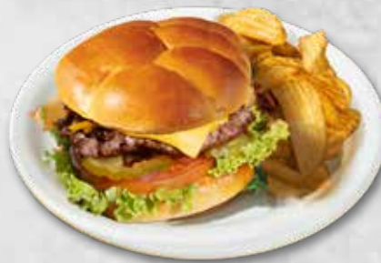
SPICY JALAPEÑO BURGER Certified Angus Beef® burger with Cheddar cheese, beef bacon, jalapeños, Denny's spicy sauce, lettuce, tomato, red onions, and pickles on a brioche bun. AED 63