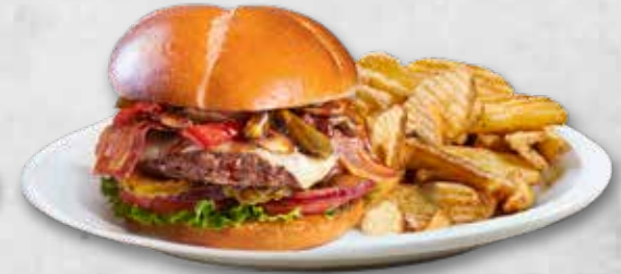
BBQ BACON BURGER Certified Angus Beef® burger with Cheddar cheese, beef bacon, sautéed mushrooms, roasted bell peppers & onions, BBQ sauce, lettuce, tomato, red onions, and pickles on a brioche bun. AED 83