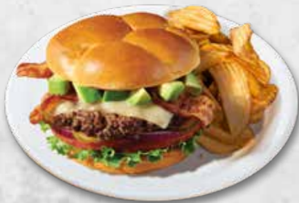
BACON AVOCADO CHEESEBURGER Certified Angus Beef® burger, beef bacon, fresh avocado, Cheddar cheese, mayo, lettuce, tomato, red onions, and pickles on a brioche bun. AED 65