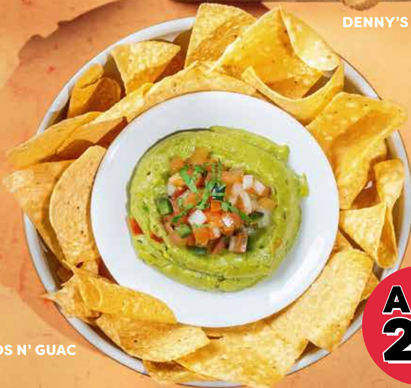
new! NACHOS N' GUAC