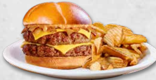
AMERICA'S DINER DOUBLE Certified Angus Beef® burger, American cheese, caramelized onions, and All-American sauce on a brioche bun. AED 69