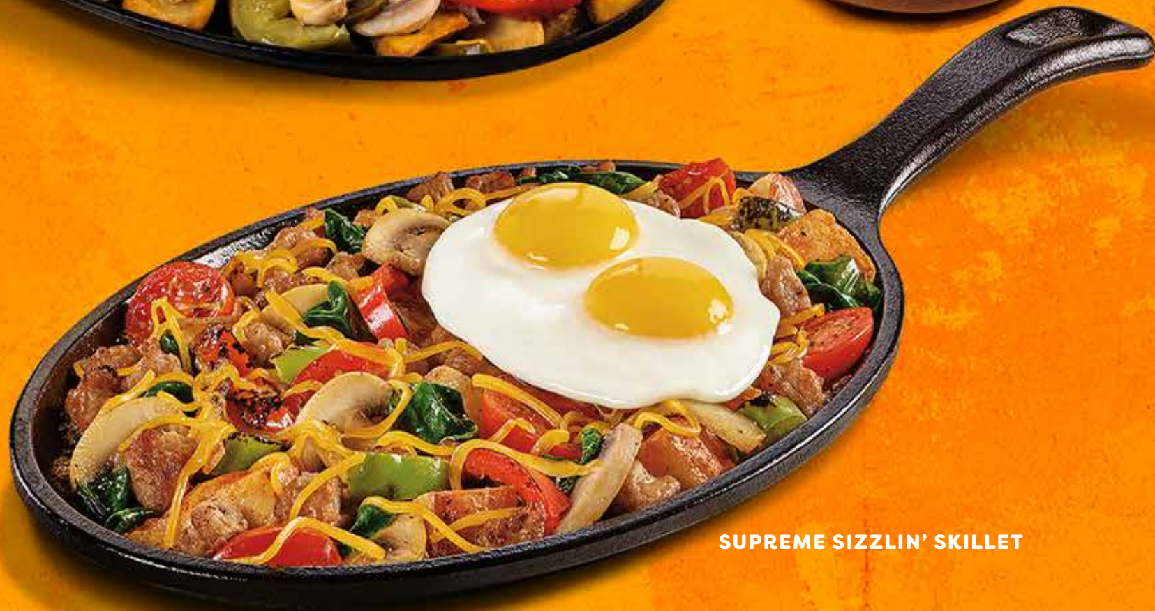
SUPREME SIZZLIN' SKILLET