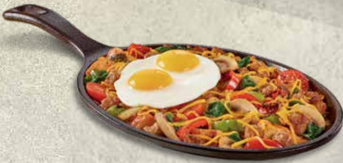
SUPREME SIZZLIN' SKILLET Chicken sausage, fresh spinach, roasted bell peppers & onions, mushrooms, cherry tomatoes, and red-skinned potatoes topped with cheddar cheese and eggs,* served in a sizzling skillet with tortillas or bread. AED 59