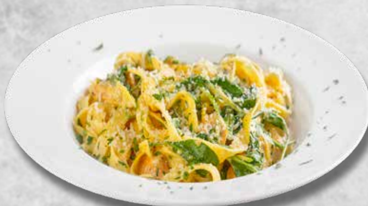
CREAMY SPINACH PASTA Pasta with Alfredo sauce and spinach, sprinkled with Parmesan, and topped with parsley. Sautéed shrimps AED 66 Grilled or breaded chicken AED 66 Veg AED 49