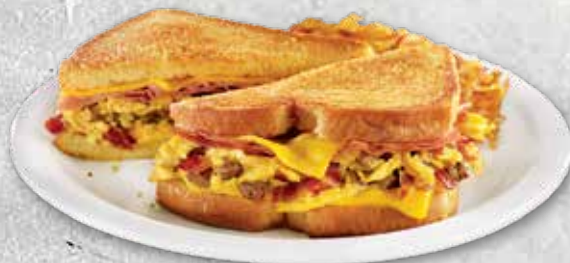
GRAND SLAMWICH® Scrambled eggs, veal sausage, beef bacon bits, turkey ham, and American cheese on grilled sourdough bread. Served with hash browns. AED 55