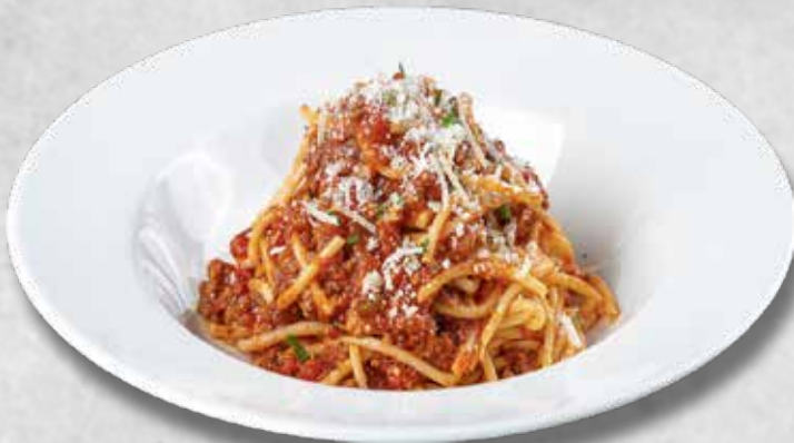
SPAGHETTI BOLOGNESE Spaghetti pasta covered in rich meaty beef Bolognese sauce, sprinkled with Parmesan, and topped with parsley. AED 66