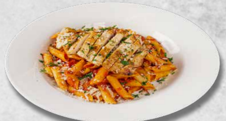
ARRABIATA Pasta in spicy red tomato-based sauce, sprinkled with Parmesan and topped with parsley. Sautéed shrimps AED 66 Grilled or breaded chicken AED 66 Veg AED 49