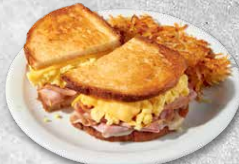
MOONS OVER MY HAMMY® Turkey ham and scrambled egg sandwich with Swiss & American cheese on artisan bread. Served with hash browns. AED 52