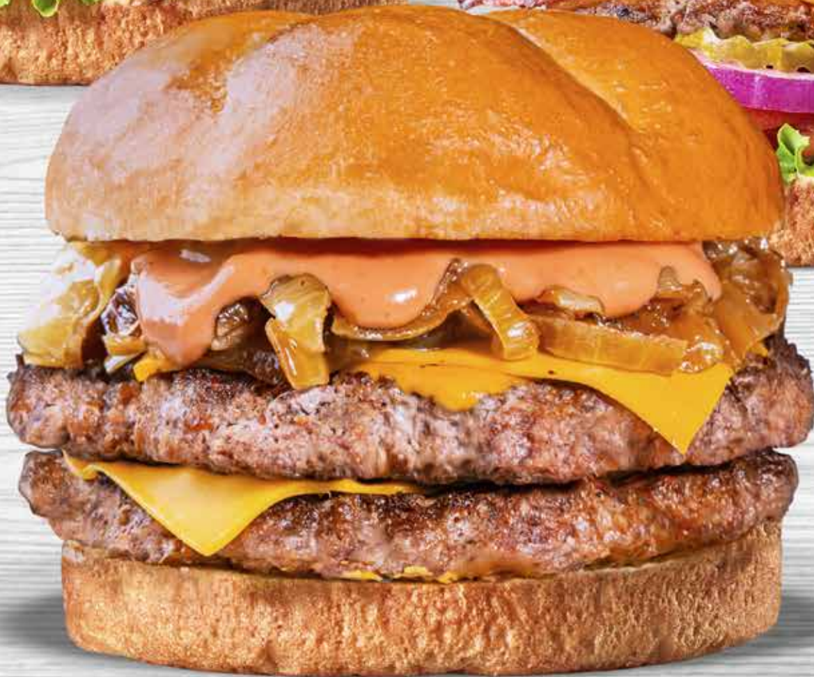
AMERICA'S DINER DOUBLE