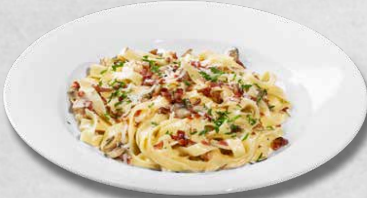
new! CARBONARA Creamy cheese sauce, beef bacon bits, and mushrooms, topped with fresh parsley and Parmesan. AED 59

SERVED WITH YOUR CHOICE OF FETTUCCINE, PENNE OR SPAGHETTI