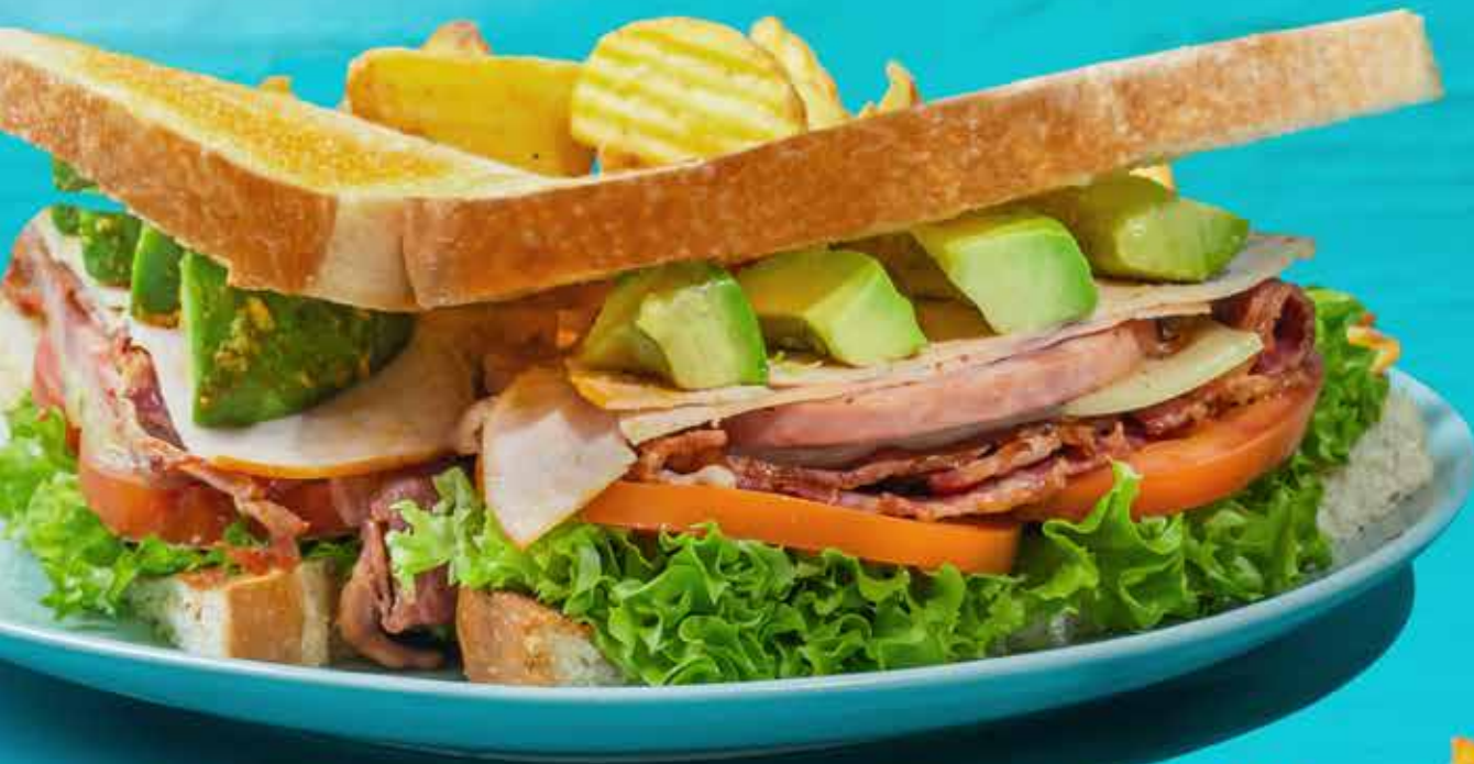
CALI CLUB SANDWICH