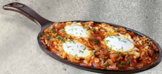
THE ULTIMATE SHAKSHOUKA Eggs* in a rich sauce made with tomatoes, bell peppers, onions and garlic, served in a sizzling skillet with tortillas or bread. AED 47