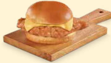
JR. FRIED CHICKEN BURGER Golden boneless chicken breast with American cheese.

PAIR YOUR MAIN WITH ONE SIDE & CHOOSE YOUR SOFT DRINK