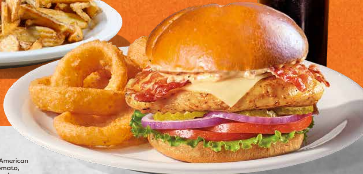
new! GRILLED TUSCAN CHICKEN BURGER

Grilled chicken breast topped with American cheese, turkey bacon, lettuce, tomato, red onions and pickles on a brioche bun. Choose mayo or Denny's spicy sauce. AED 54